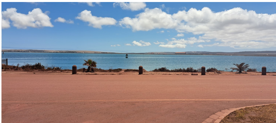
A view from where I train at Portnet Saldanha