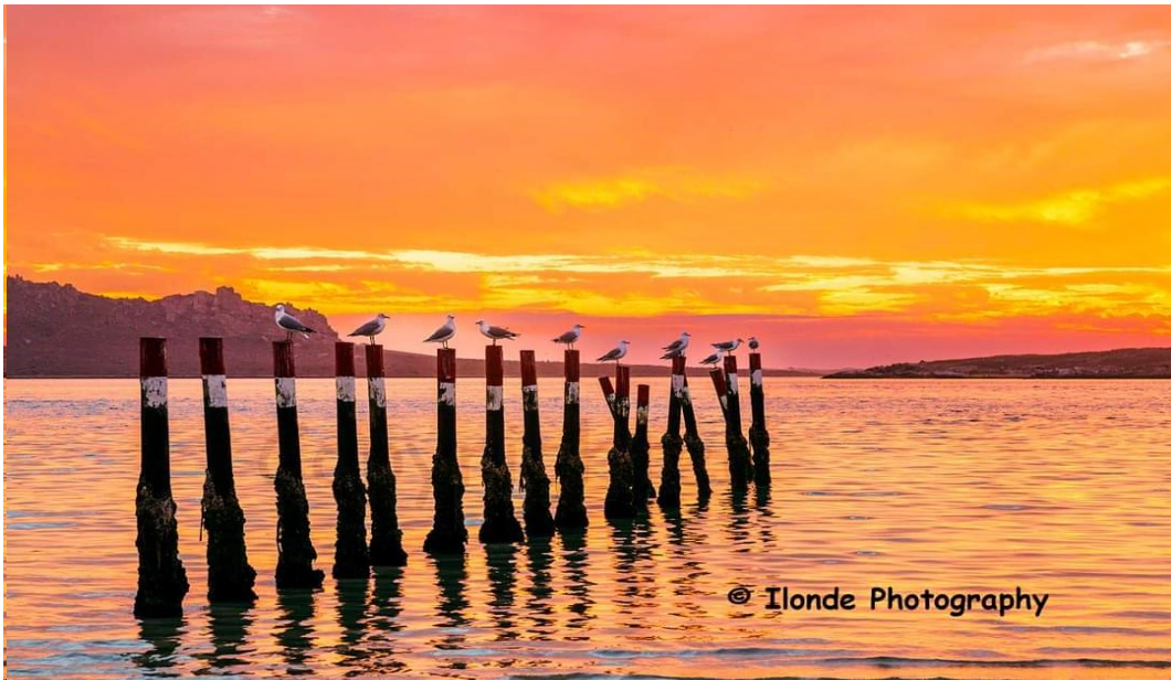
Sunset over the lagoon at Langebaan.

This is where the editor calls it quits for this edition. The next one will be in the new year 2024 . So have a merry Christmas and a great New Year. Stay safe and well and if travelling drive carefully.